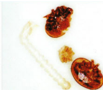
A pupal antenna from the floor debris together with an adult, a damaged adult and a nymph.

Ron has conducted painstaking studies over a number of years observing thousands of mites under the microscope and has set up a breeding programme to select the bee colonies that cause most damage to the mites.